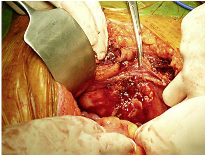
Fig. 2. Intraoperative photograph demonstrating colon perforation.