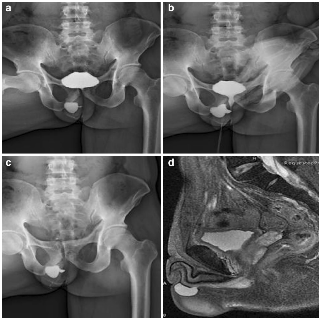
Fig. 1 a Retrograde urethrogram showing the urethral diverticulum at the penoscrotal level ( A full bladder period ). b Retrograde urethrogram showing the urethral diverticulum at the penoscrotal level ( Emptying period ). c Retrograde urethrogram showing the urethral diverticulum at the penoscrotal level ( Empty period ). The swelling is still remain contrast filled after urethral emptying. d MRI reveals a fluid and hypodense mass correlated with urethra

The post-operation pathological report indicates that it was lined by fibrovascular proliferation, granulation tissue and chronic inflammation. Post-operation recovery was uneventful. At 8 month follow-up, he had a normal urinary stream without any swelling, no urinary complaints, and he is satisfied with ejaculation. Of the most important, his wife was pregnant successfully. The report is according to the diagnosis of the urethral diverticulum.