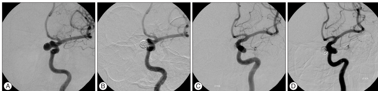
Fig. 1. Cerebral angiograms of a 44-year-old woman showing minor change. A : A left ICA angiogram shows a paraclinoid wide-necked aneurysm. B : An immediate angiogram after coil embolization shows near complete packing. C : An angiogram obtained 10 months later shows contrast filling in the aneurysm neck (minor change). D : A follow-up angiogram at 58 months shows neck filling, but no more severe compaction. ICA : internal carotid artery.