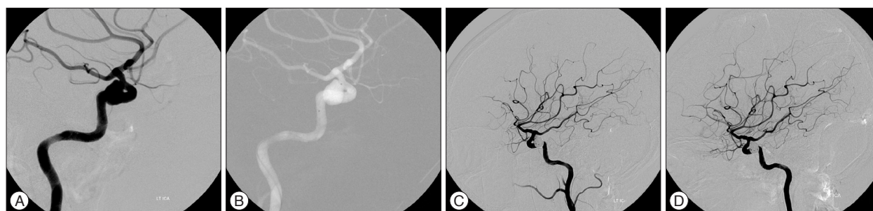
Fig. 3. Cerebral angiograms of a 62-year-old woman showing better change (progressive thrombosis). A and B : A left ICA angiogram reveals a superior hypophysial artery aneurysm identified incidentally. C : An angiogram immediately after coil embolization with double microcatheters reveals neck filling. D : A follow-up angiogram performed 6 months later reveals progressive thrombosis. ICA : internal carotid artery.