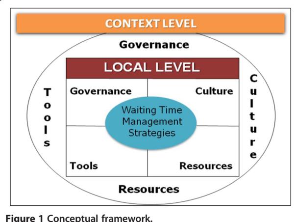
Figure 1 Conceptual framework.

1. Articles referring to wait time management for scheduled care: diagnostic imaging and elective surgery were selected for additional searches to complement the main search and to ensure all relevant articles were captured. More specifically, we selected articles that: described a model or framework of factors influencing WTMS success or failure at the organizational level; referred to an organizational initiative that specifically addressed wait time or wait lists; referred to higher level (national or provincial) strategies or policies that addressed WTMS;