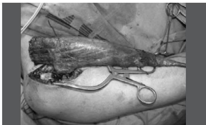
Figure 2 – Gracilis flap for insertion.

of the arterial anastomosis and donor nerve will also need to be changed.