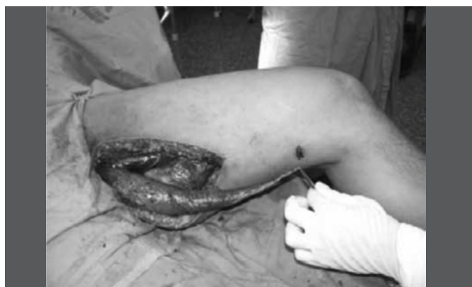
Figure 1 – Removal of flap from gracilis.

Some authors have preferred that the proximal insertion should be made in the clavicle (6-8) , coracoid process or even in the ribs (9) . According to the place where this insertion is made, the site