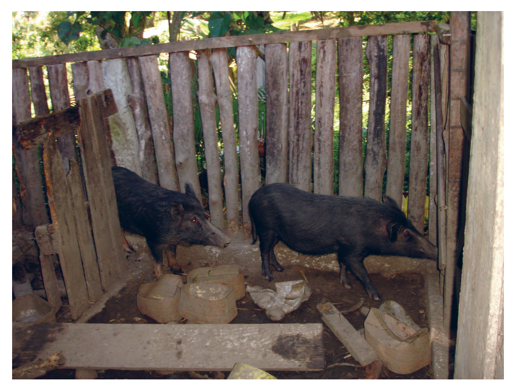
Photo: Backyard subsistence pig farming is probably a major source of leptospirosis in most of the Pacific Island Countries and Territories, where the highest burden is reported from around the globe (from C. Goarant, used with permission)

The research community as well as funding agencies tend to show favouritism for "hot topics" instead of allocating resources based on health needs. Leptospirosis is not regarded as an exciting field and leptospirosis research consequently suffers a major lack of resources. Relying on the global burden of diseases to allocate research funding could avoid the vicious circle of neglect in which leptospirosis currently sits.