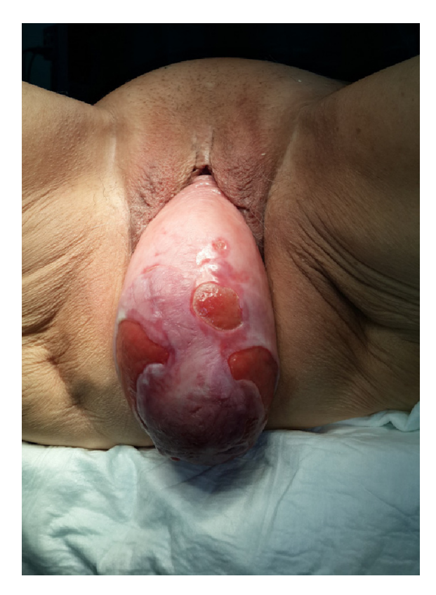
Figure I A patient with stage 4 pelvic organ prolapse.

Demographic characteristics, including age, parity, mode of delivery, and the presence/absence of hypertension and diabetes, were recorded. All patients provided detailed histories and underwent complete gynecological examinations. Prolapse assessment was performed by a specialist, using the POP quantification (POP-Q) system.<sup>16</sup> Objective recurrence