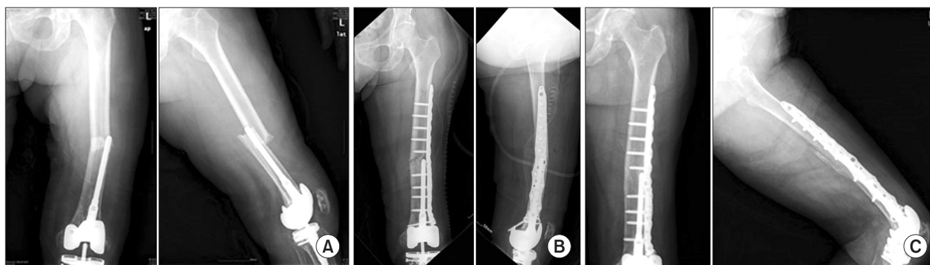
Fig. 4. (A) Preoperative radiographs of a femoral periprosthetic fracture that occurred above the tip of the stem extension attached to the revision implant. (B) This fracture was treated by a precontoured polyaxial locking plate with allogeneous bone graft. (C) Union was achieved 6 months after the surgery.

NCB (Non-contact Bridging Plate; Zimmer Inc., Winterthur, Switzerland) can be used in this type of fractures (Fig. 4). The NCB plate utilizes a 30° polyaxial locking screw mechanism to maximize the chance of scant bone stock purchase despite the space-occupying stem extension or the revision implant. Polyaxial screws can be used both as a locking screw and a compression screw according to the situation, and one screw resists a load of 225 N at a distance of 25 mm from the plate 39 . Erhardt et al. 39 reported excellent outcomes of NCB in their study on 12 Rorabeck and Taylor 17 type II fractures. Ruchholtz et al. 36 mentioned that a locking plate was the actual treatment of choice in a periprosthetic fracture with a stable intramedullary stem or implant, and reported that they could set a minimum of 3 and a mean of 5.4 bicortical screws around a stem with NCB.