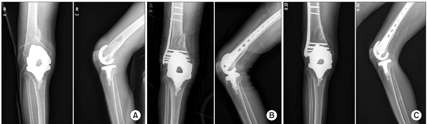
Fig. 2. (A) Preoperative radiographs of a femoral periprosthetic fracture with a reverse-oblique fracture line involving the anterior flange of the femoral component. (B) This fracture was treated by a unilateral locking compression plate. (C) Fracture union with remodeling is evident on the last follow-up radiographs.

There are few remaining choices for internal fixation of femoral periprosthetic fractures occurring above the stemmed revision implant. Considering the coarse bone stock around the metaphyseal region and the primary load bearing of the stem, diaphyseal fractures adjacent to the stem tip will occur rather than metaphyseal fractures in this situation. A polyaxial locking plate such as