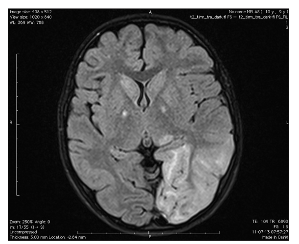
Figure 5. MRI revealed (Flair) areas of increased signal bilaterally in globus pallidus and in posterior part of the left thalamus.

Lesions tend to appear in locations other than previously, which is a particularly characteristic symptom of MELAS syndrome [4,10,11,16].