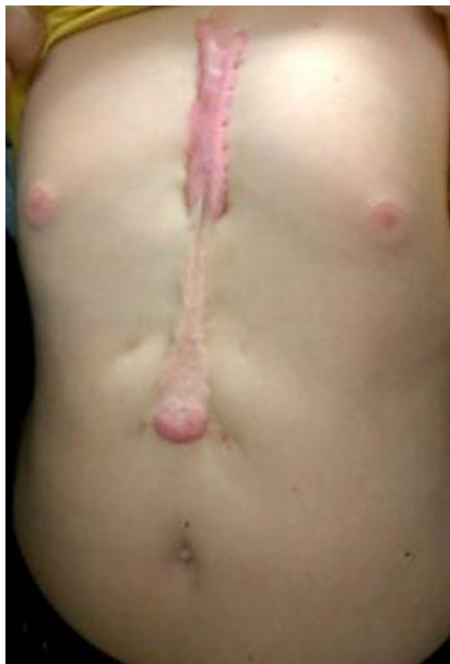
Fig. 1. A keloid along the location of the previous sternotomy for correction of transposition of the great arteries.