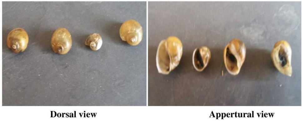
Figure 2. Shell of Bulinus snails (collected at Alwero Dam reservoir, Ethiopia).