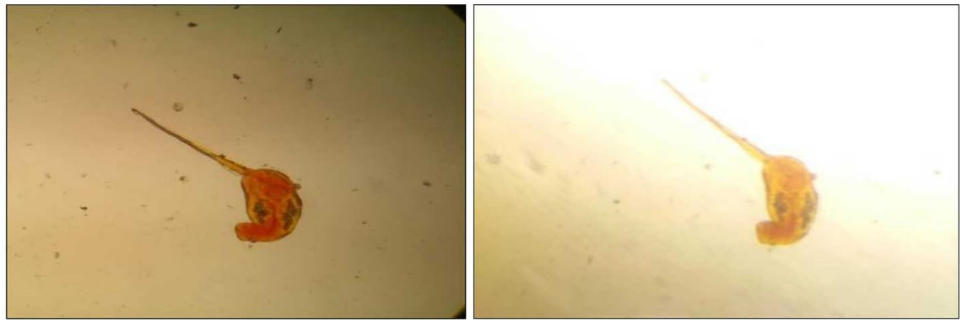
Figure 3. Image of Echinostome cercariae shed by Bulinus snails, Alwero Dam reservoir, Ethiopia.