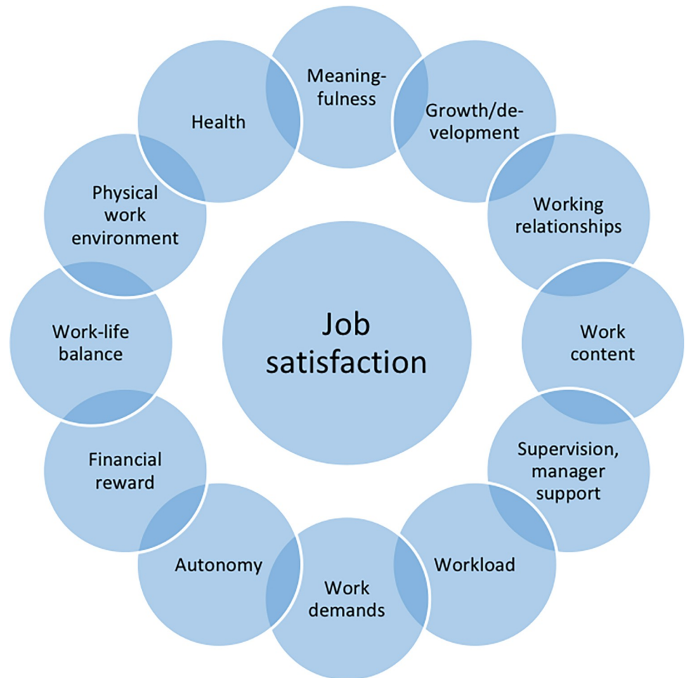
Fig 2. Domains of midwives' job satisfaction.

https://doi.org/10.1371/journal.pone.0275327.g002