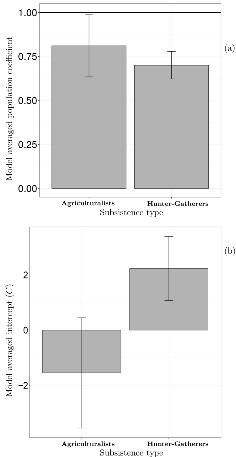
Fig 1. Model averaged population coefficients and intercepts from regression Eqs 7 and 9 and the 95% confidence interval for each coefficient or intercept shown as error bars for each subsistence type.