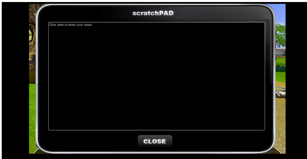
Fig. 3. Screenshot of the digital notepad within the environment.

bee scenario, students completed an average of 196 actions, producing 396,760 actions in total. During this time, student actions, notes, and performance in the virtual assessments were automatically logged, facilitating the development of several different kinds of measures for later analyses.