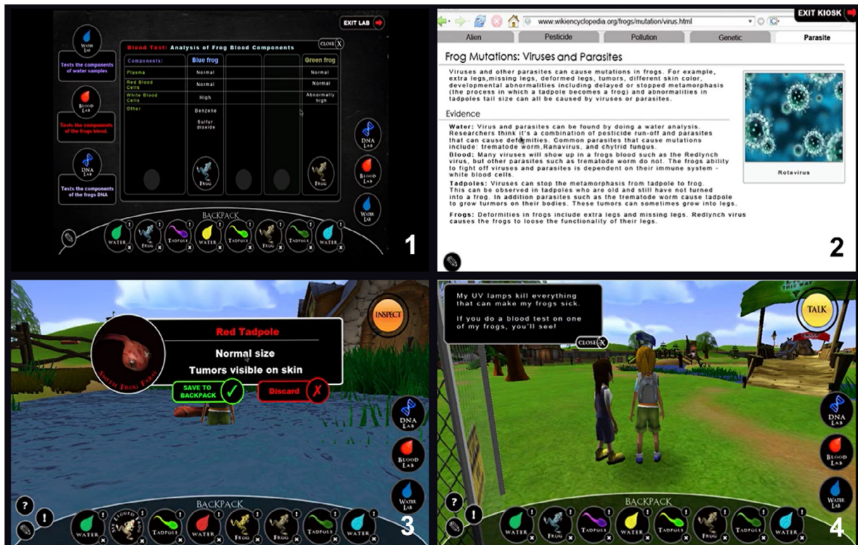
Fig. 2. Screenshots of the different data sources in the frog scenario: (1) laboratory test results, (2) research kiosk page, (3) field observation, and (4) conversation with NPCs.