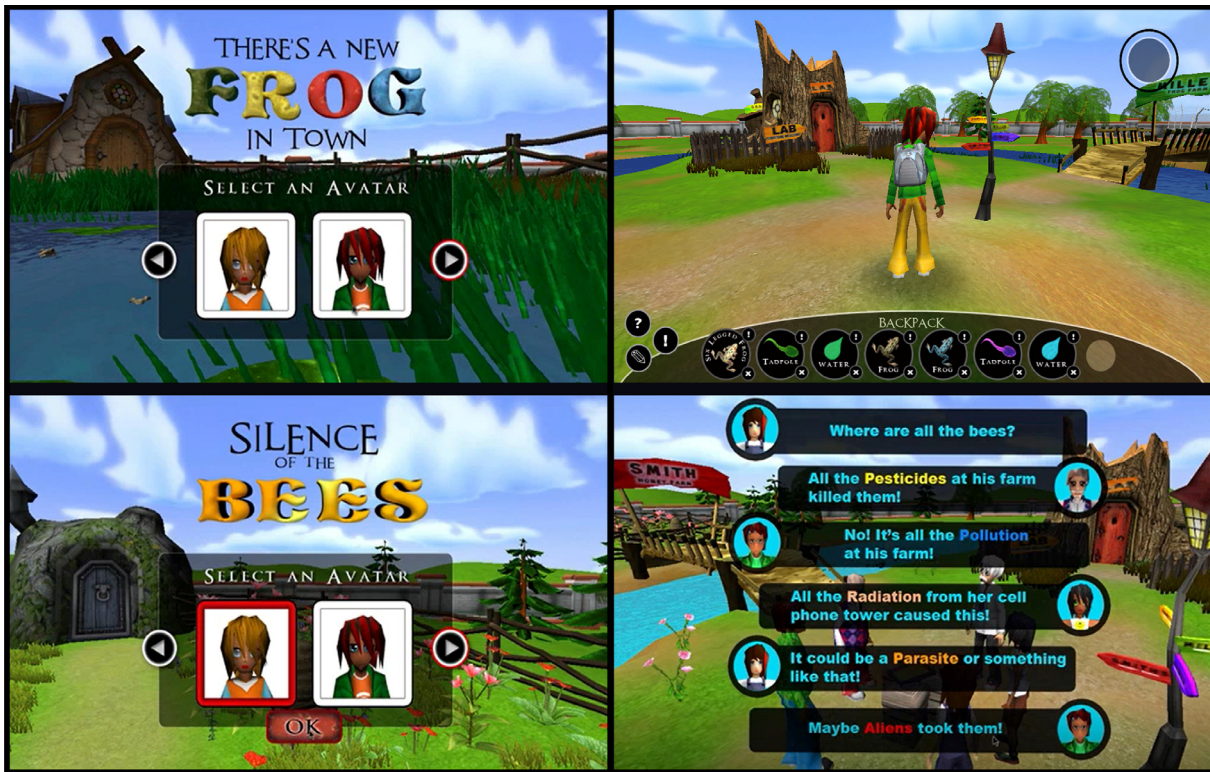
Fig. 1. Screenshots of the frog scenario (top) and the bee scenario (bottom) of Virtual Performance Assessments.