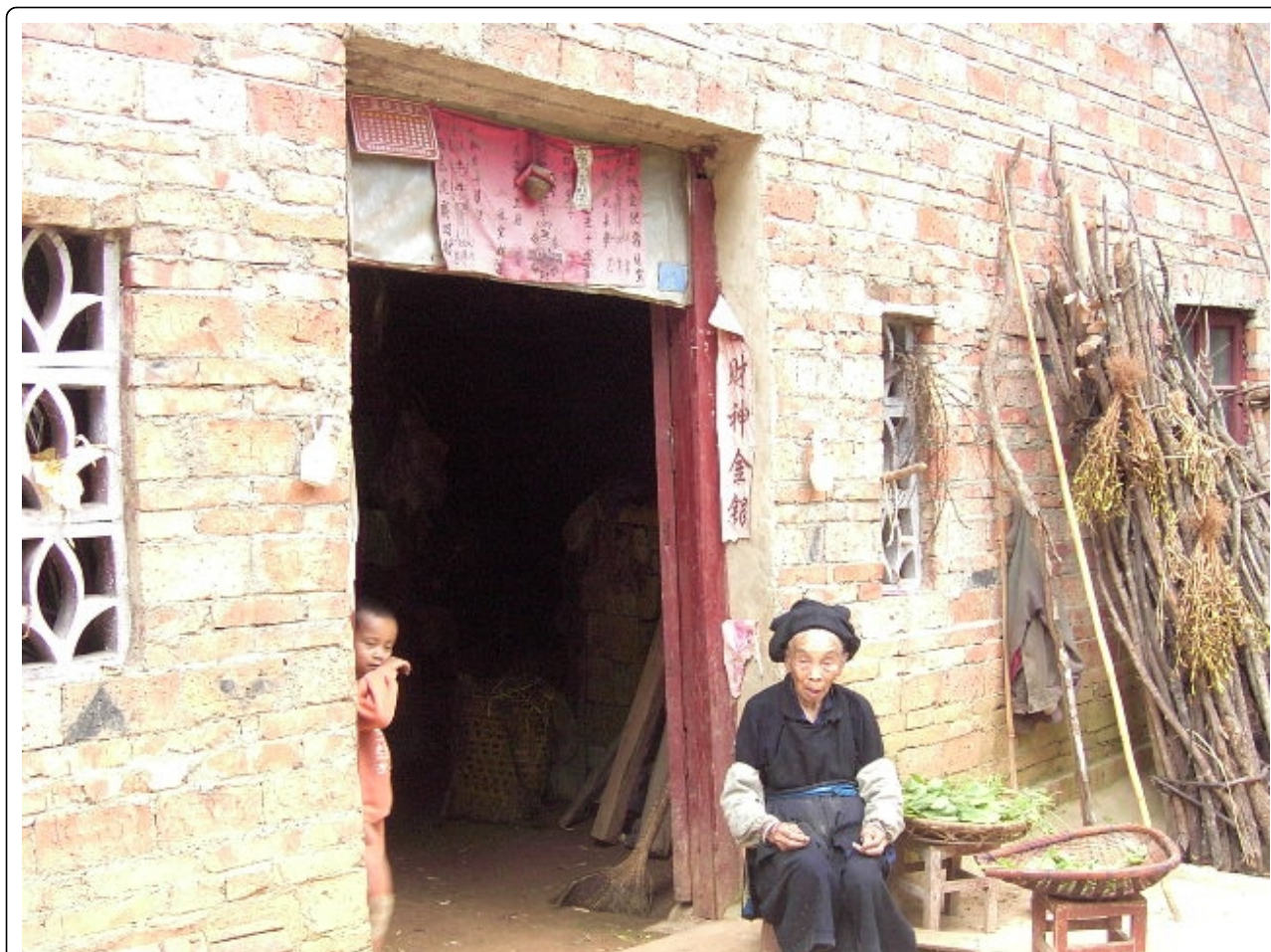
Figure 2 A village herbalist in rural Yunnan, Southern China. This lady was a key informant for an ethnobotanical study into plants used to repel mosquitoes.

was originally extracted for use in perfumery, and its name derives from the French citronelle around 1858 [28]. It was used by the Indian Army to repel mosquitoes at the beginning of the 20 th century [29] and was then registered for commercial use in the USA in 1948 [30]. Today, citronella is one of the most widely used natural repellents on the market, used at concentrations of 5-10%. This is lower than most other commercial repellents but higher concentrations can cause skin sensitivity. However, there are relatively few studies that have been carried out to determine the efficacy of essential oils from citronella as arthropod repellents. Citronella-based repellents only protect from host-seeking mosquitoes for about two hours although formulation of the repellent is very important [31,32]. Initially, citronella, which contains citronellal, citronellol, geraniol, citral, \alpha pinene, and limonene, is as effective dose for dose as DEET [33], but the oils rapidly evaporate causing loss of efficacy and leaving the user unprotected. However, by mixing the essential oil of Cymbopogon