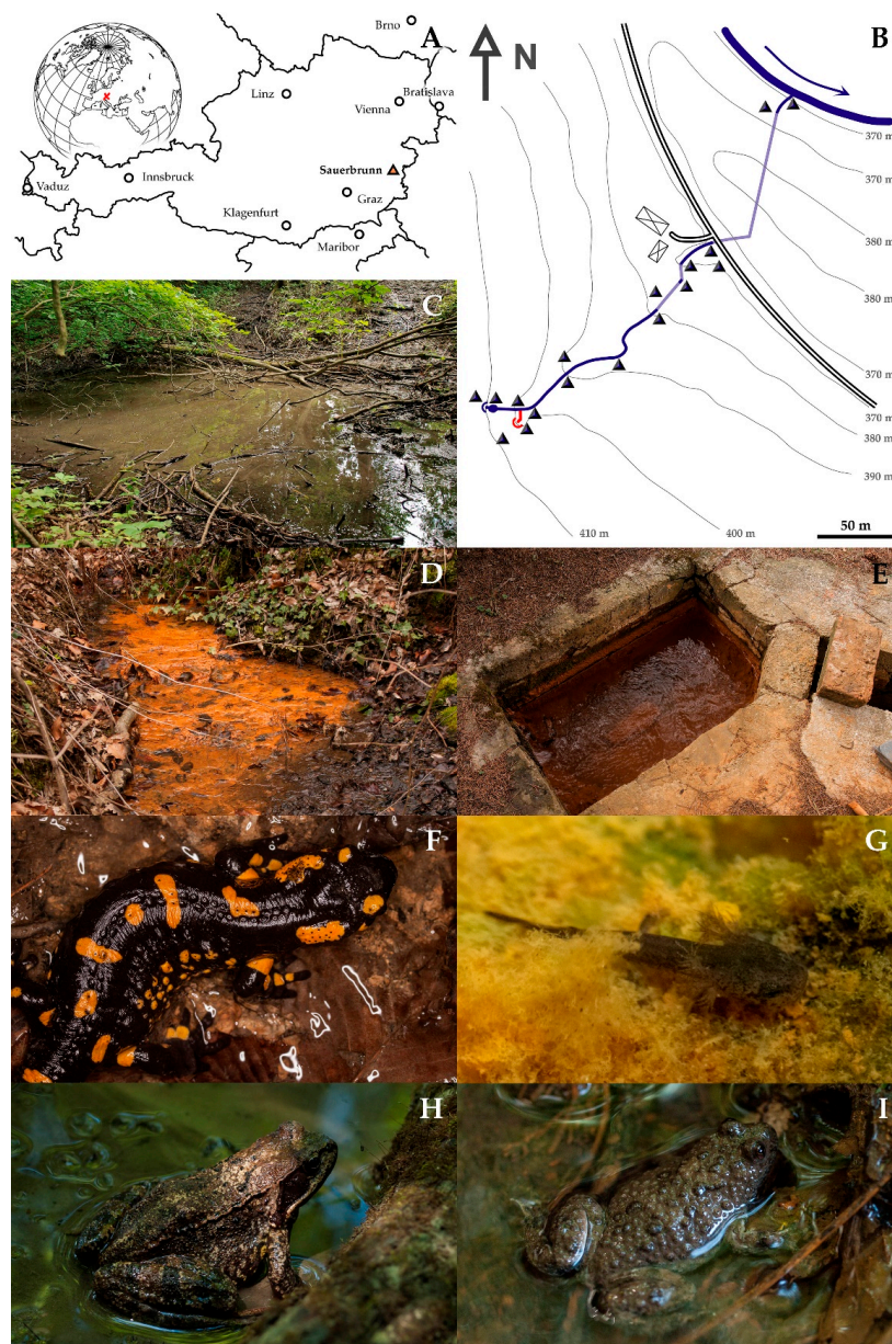
Figure 1. Habitat and amphibians. (A) Localisation of the study area within Austria/Europe. (B) Topographical sketch of the study area. The creek arises from a well, immediately followed by a

One of these habitats is localized in Burgenland/Austria (Figure 1A), next to the city of Stadtschlaining, where a large deposit of the metalloids antimony (Sb) and arsenic (As) was exploited for centuries [8]. After the closure of the mines in 1990, efforts were undertaken to remediate remaining spoil heaps by removal of contaminated material or by covering spoil heaps with uncontaminated soil (personal communication by local landowners). However, numerous spots can still be identified where toxic metalloids occur in concentrations increased by human activities and affect the biocoenosis [8]. The highest metalloid concentrations, both in the water and the sediment, were found in a small creek at Sauerbrunn (German for sour well), originating from a spoil heap and running into the considerably larger Tauchenbach River. However, this creek still hosts amphibians in a remarkable diversity and abundance [7].