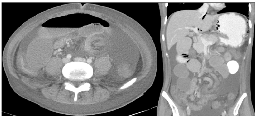
Fig. 1. Abdominal CT showing intussusception.