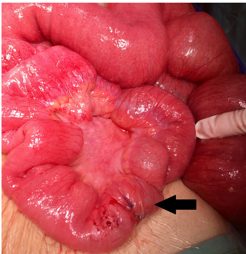
Fig 3. Enterotomy site revealed as lead point after reduction (arrow).