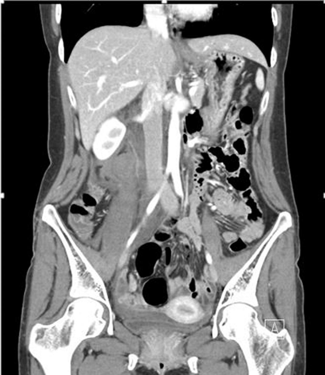
Fig. 1. Coronary CT finding. Showing hematoma around the site of the stab wound and right psoas muscle.

stenting of the ureteral catheter. The postoperative course was uneventful except for focal flank pain, and the patient was discharged on postoperative day 12. Two weeks after discharge, the patient visited the outpatient clinic due to right flank pain. Abdominal CT scan was performed, and massive liquefaction of the hematoma was observed in the injured area of the right psoas muscle. The flank area pain subsided after drainage was performed using a percutaneous catheter. At two months post-surgery, intravenous pyelography was performed, and the double-J stent was removed.