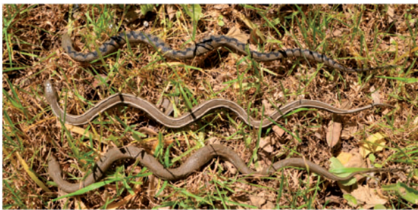
Figure 2. Plasticine models used for the experimental study of predation upon the viperine snake, Natrix maura . From top to bottom, zigzag, striped (bilineata) and uncolored (control) model.

Notes: We include the geographic coordinates for the barycentre of the localities, the habitat (2 possibilities, open when marshlands or peat bogs, and closed when others), the phylogenetic clade, the distance to the closest viper population ( Vipera latastei ), the sample size (N), the frequency of the bilineata (BL) and zigzag (ZZ) dorsal pattern, and the provenance of the sample. Abbreviations are as follows: EBD, Estación Biológica de Doñana, Sevilla, Spain; DBAG, departamento de biología animal, Granada University, Spain; CRBA, Centre de Recursos de Biodiversitat Animal, Barcelona University, Spain.