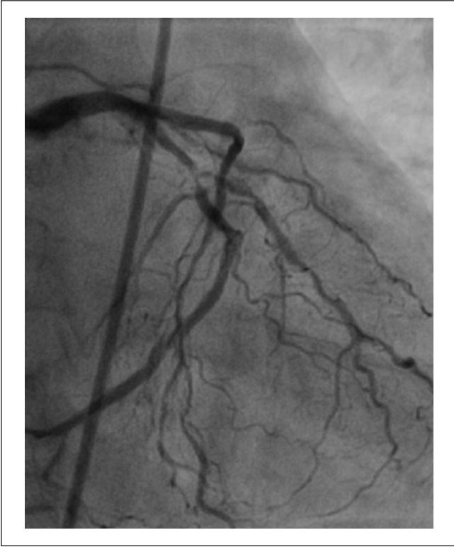
Figure 1. Coronary angiography revealed a Medina 1-1-1 obtuse marginal branch of circumflex coronary artery (CX-OM) bifurcation lesion.