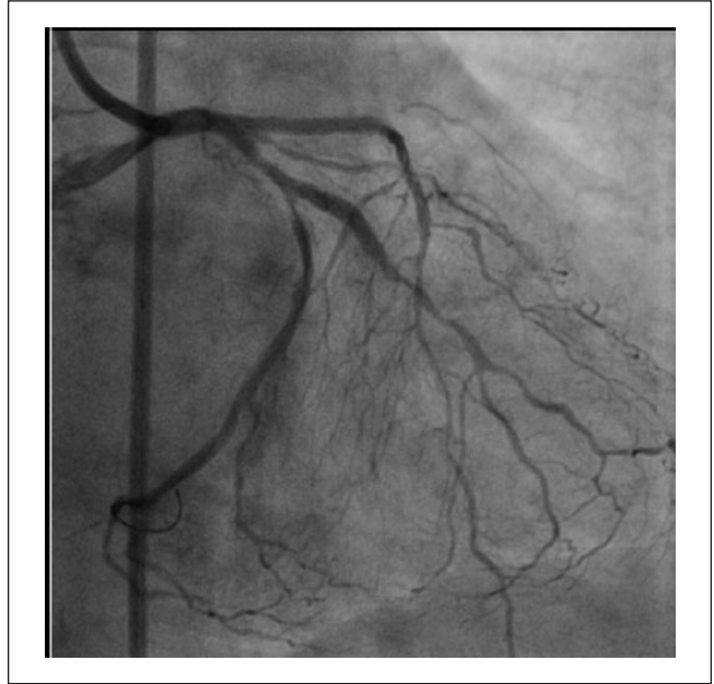
Figure 2. The arrows showing localized haziness appeared in the main branch stent both in the proximal part and distal to the OM take off.

18 atm. Thereafter, while parking a balloon in the main branch, a 2.5 \times 18 -mm stent (Endeavor Resolute; Medtronic) was deployed in the side branch at 12 atm and postdilated with a 2.5 \times 12 -mm noncompliant (NC) balloon (Simpass; Simeks) at 20 atm. Subsequently deploying the main branch balloon, a mini crush was performed and another 2.5 \times 30 -mm stent (Endeavor Resolute; Medtronic) was implanted at 20 atm into the Cx body. The OM was rewired and final kissing was performed with NC balloons. Thereafter, localized haziness suggesting thrombosis at first sight appeared in the main-branch stent, both in the proximal part and distal to the OM take off (Figure 2). The patient had no symptom and was hemodynamically stable. StentBoost showed stent fracture and disruption (Figure 3). Another Endeavor Resolute stent was implanted at 14 atm to cover the fracture sites. The final result was satisfactory (Figure 4).