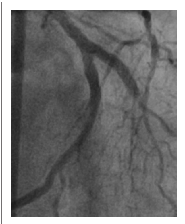
Figure 4. Endeavor Resolute stent was implanted at 14atm. The final result was good.

data does not allow precise timing of the fracture, but as demonstrated in this case the possibility of fracture at initial implantation is not to overlook. SF was identified in 23.9% of cases of sirolimus-eluting stent-associated restenosis and in 9% of cases of restenosis of PES. 12 There are only a few case reports on ZES fracture in the literature. Venero et al. 13 reported a ZES fracture in an aortocoronary saphenous vein bypass graft (SVG). Recently, Lee et al. 14 described two cases of ZES fracture: one was detected with intravascular ultrasound (IVUS) and the other with conventional coronary angiography.