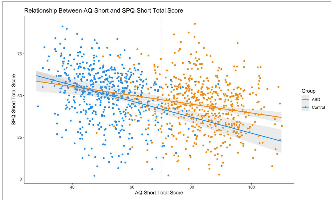
Figure 3. Relationship between AQ-Short and SPQ-Short total scores. Colored lines indicate linear regressions, the gray area around them are 95% confidence intervals. The vertical dotted gray line indicates the AQ-Short cutoff of 70, as suggested by Hoekstra et al. (2011).