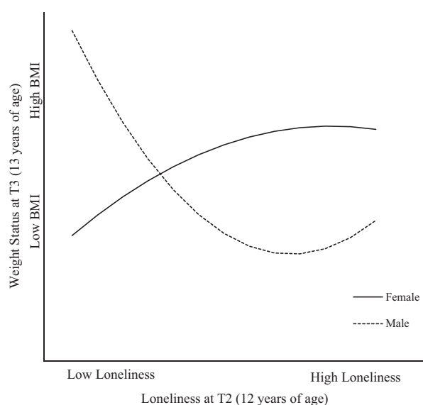
Fig. 2 Slopes of the relation between loneliness T2 (age 12 years) and BMI T3 (age 13 years) as a function of gender

years for boys. This result suggests that loneliness may have a particular role in increasing weight for girls and reducing weight for boys. There were no other significant linear or quadratic effects of loneliness on z-BMI over time (See Tables S4–6 for details).