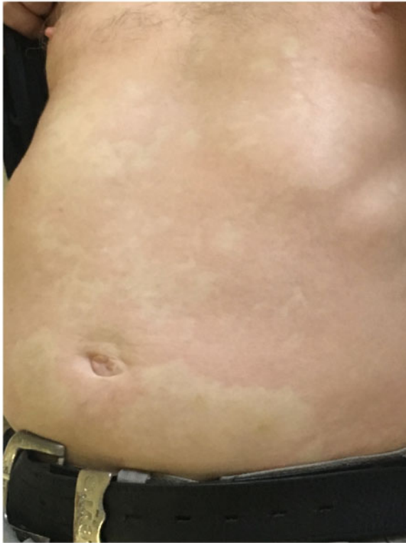
Fig. 2 Urticarial-like rash typical of Schnitzler's syndrome

as phytohaemagglutinin and LPS. Further studies demonstrated that LPS stimulation of RIPK1-deficient monocytes resulted in increased necroptosis (inflammatory cell death) and IL-1 \beta release; this has also been observed in animal models.