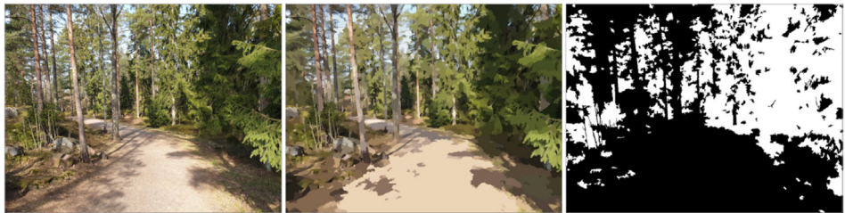
Fig. 2. A. Left: The original image. Middle: The segmented image Right: The final binary image in which the white areas represent vegetation. The GVI of this image is 38%. Note: The image is self-taken and it simulates here the copyrighted GSV images.

dataset (id, street name, road class, functional class, traffic direction, type of the street segment and binary cycleway column).