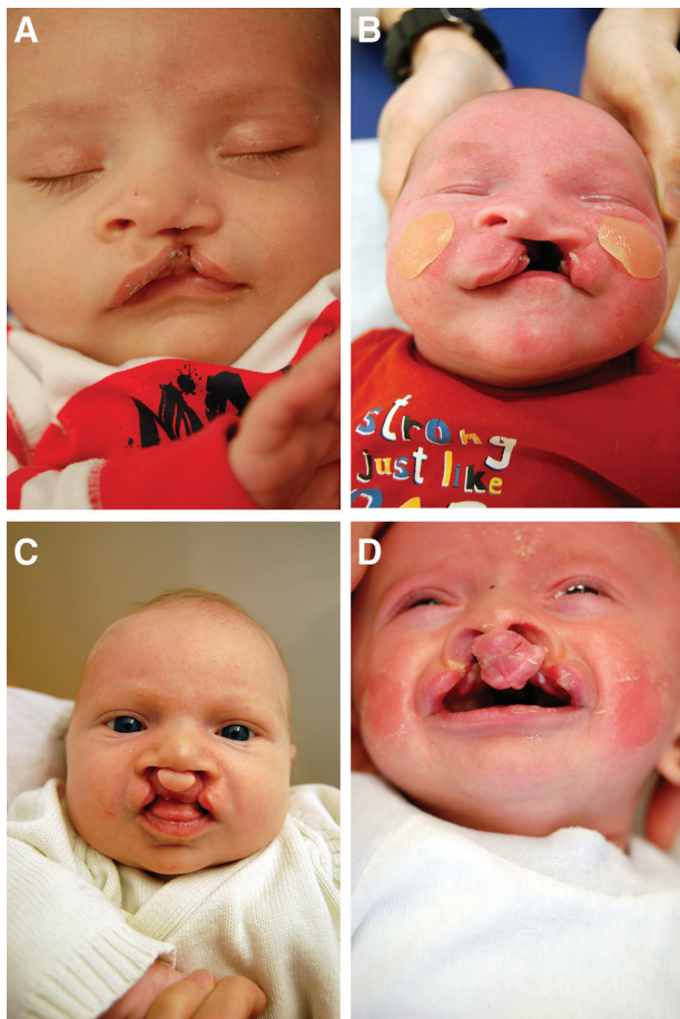
Fig. 1. Classification according to the severity of cleft lip and palate. Representative photographs (camera body: Nikon D40; Japan; lens: Nikkor AF-S micro 600 mm 1:2.8 G ED; Nikon, Japan) of cases with moderate (A and C) and severe (B and D) subclassified unilateral (A and B) and bilateral (C and D) cleft lip palate.

aesthetically according to nasal form, nasal symmetry, and cupid's bow. The counts were collected and summarized for all raters for each match.