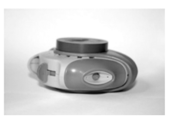
Figure 2 The INCA system. which is an open-access article distributed under the terms of the creative commons attribution license, permitting its unrestricted use, distribution, and reproduction in any medium, provided the original author and source are credited.

There are different electronic devices that provide information on the correctness of the patient inhaler technique and treatment adherence. One example is an electronic audio recording device called an INhaler Compliance Assessment (INCA) device (Figure 2). The INCA is an electronic device that is attached to the Diskus inhaler. By recording sound during the use of the inhaler, it can objectively evaluate different aspects of inhaler use every time the patient uses the inhaler, including the moment of use, the time elapsed between doses, and the accuracy of inhaler use.<sup>35</sup> A recent study has evaluated this device, helping clinicians learn why