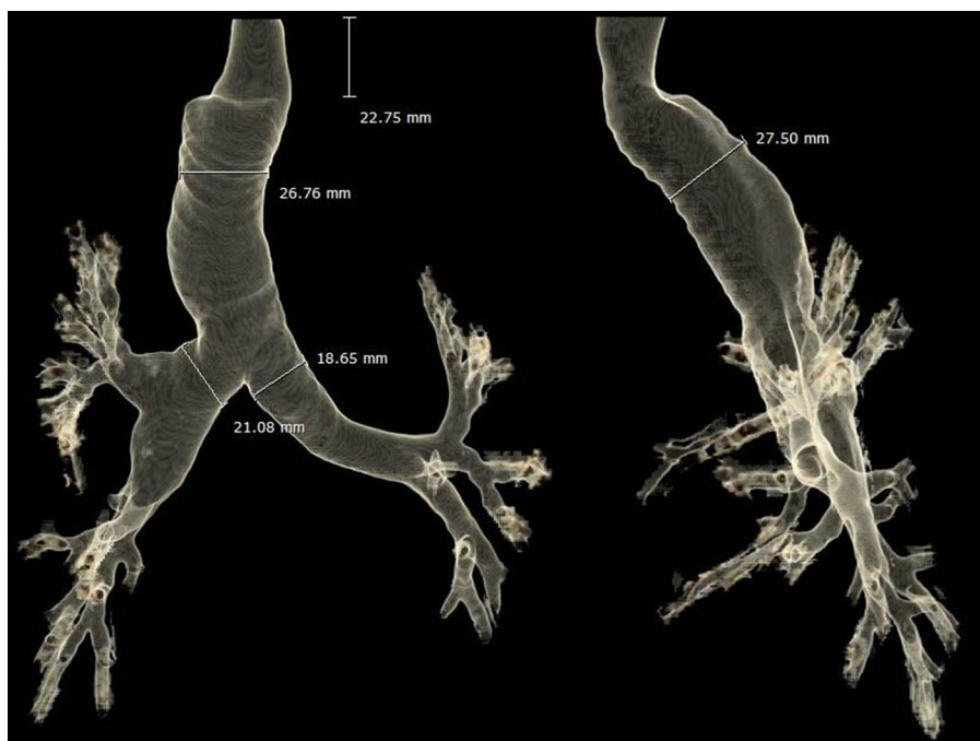
Fig. 2. Three-dimensional reconstruction of the preoperative thoracic computed tomography images showing severe dilation of the trachea and mainstem bronchi. Anteroposterior (left) and lateral (right) views.

management of patients with MKS during general anesthesia. One author in our team had previous experience of managing the airway of a patient with MKS, involving subglottic placement of the cuff of a large-sized tracheal tube [2]. In that case, the patient did not experience postoperative complications such as tracheal stenosis due to the tube cuff [2], despite the recommendation by some physicians of using a cuffless tube with oral packing to avoid this possible complication [13]. Some physicians have also recommended creating an airtight seal using a large-sized tracheal tube and/or subglottic placement of tube cuff to prevent pulmonary aspiration [2,7]. However, in the present case, aspiration of the gastric content did not occur despite the lack of these precautions.