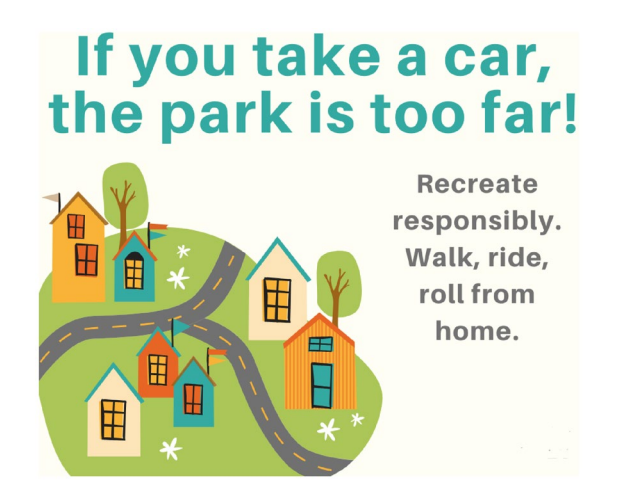
Fig.5 A public information campaign graphic instructing residents to "recreate responsibly" by only using parks to which they can walk or bike during the pandemic in Mercer Island, Washington.

near hazardous sites, may previously have been the sites of severe pollution (Su et al. 2011, p 323), or lack upgraded amenities (Sister, Wolch, and Wilson 2010, p 244).