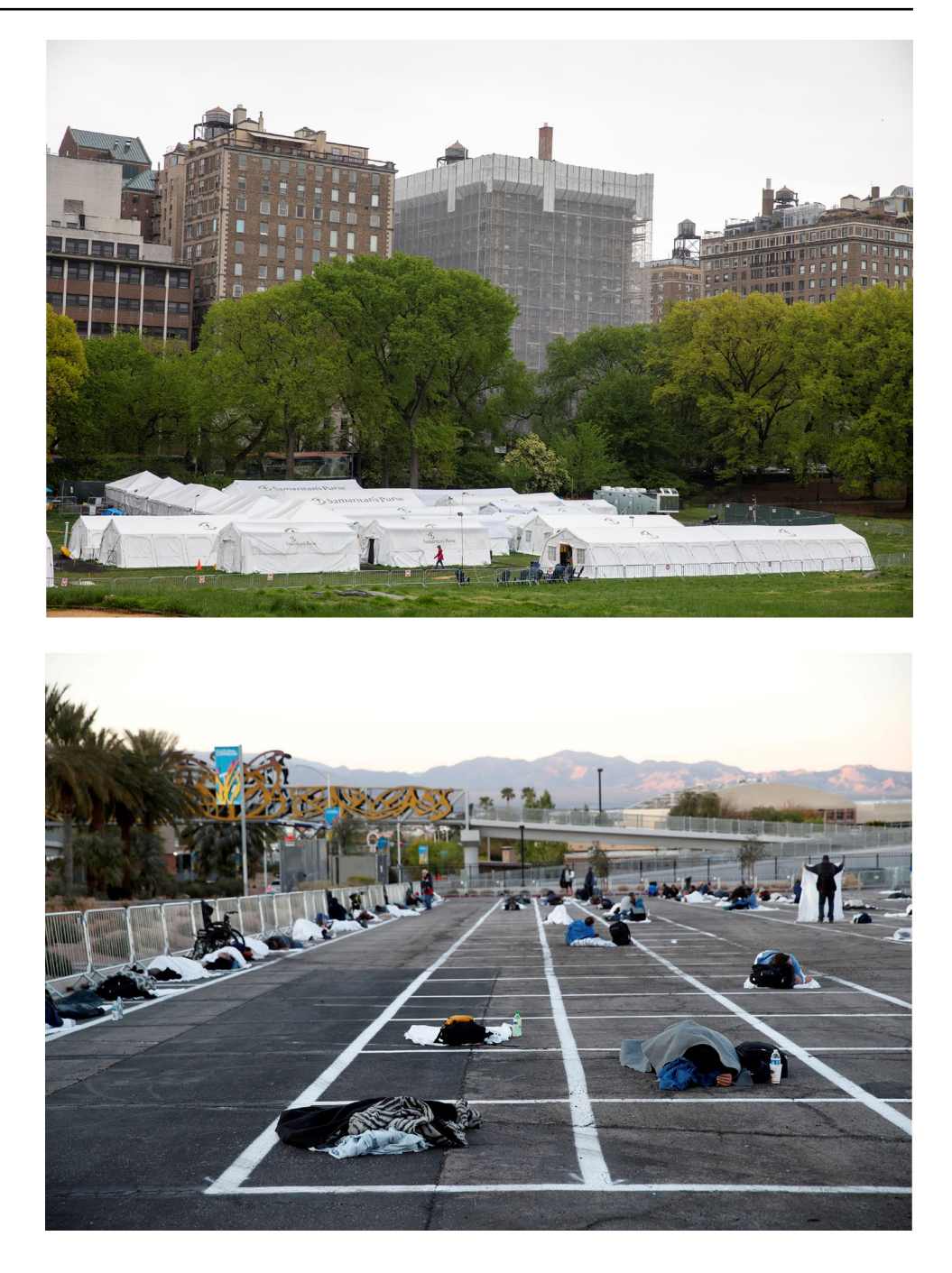
Fig. 1 Top: the Samaritan's Purse Emergency Field Hospital in Central Park, May 8, 2020. Source: Lucas Jackson/Reuters; used with permission. Bottom: Las Vegas parking lot re-purposed for a physically distanced homeless "shelter," March 30, 2020. Source: Steve Marcus/ Reuters; used with permission

many white and non-Black Americans, this was a stunning example of how overt racism is wielded against Black people in all public spaces.