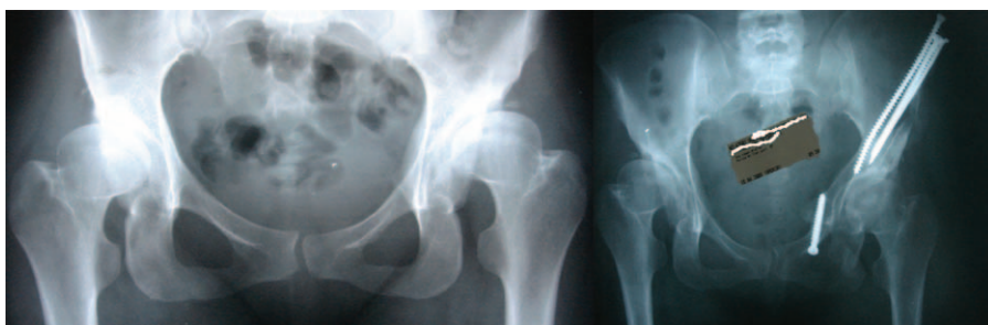
FIGURE 2. Patient 2: residual acetabular dysplasia; 30-year-old female; operated at the age of 1 for developmental dysplasia of hip; pre-postoperative radiography.

The other clinical features VAS, HHS, and WOMAC scores were better postoperatively in both groups. These are