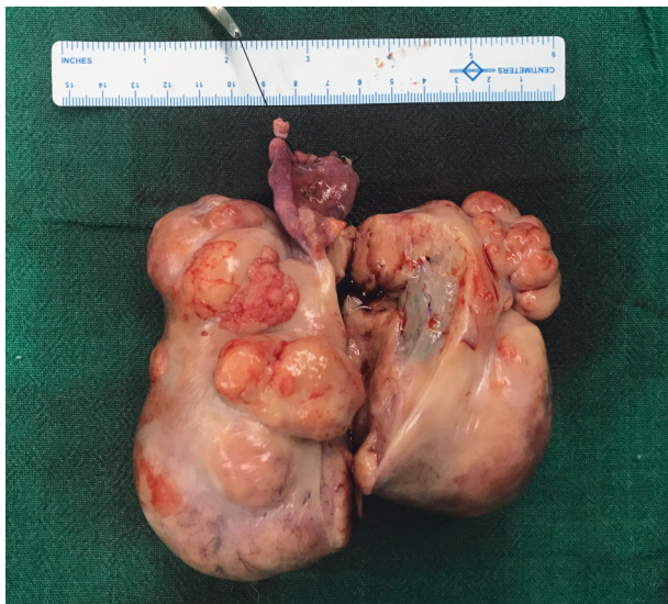
FIGURE 2: Resected specimen showing cut opened the right ovary with an attached fallopian tube. The right ovary measures around 15 cm \times 10 cm with a bosselated outer surface. The ovary is entirely replaced by a solid mass which greyish-yellow with focal areas of myxoid changes and haemorrhage with an intact capsule. The fallopian tube appears normal.

adrenal tumors, and these tumors may be identified by necessary dedicated imaging studies. The common age of presentation of gonadoblastomas is in the second and third decade [7]. The common clinical manifestations of these ovarian tumors include hirsutism, virilization, menstrual abnormalities, and abdominal pain/distension [7]. The characteristic features of virilization seen in gonadoblastomas are due to excessive production of testosterone by