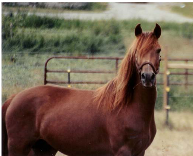
Figure 3 A chestnut Morgan horse that carry the Silver mutation. This particular individual (Amanda's Suzie Q) indicate that the Silver mutation in horses has little or no effect on pheomelanin (as mane does not seem to be diluted).