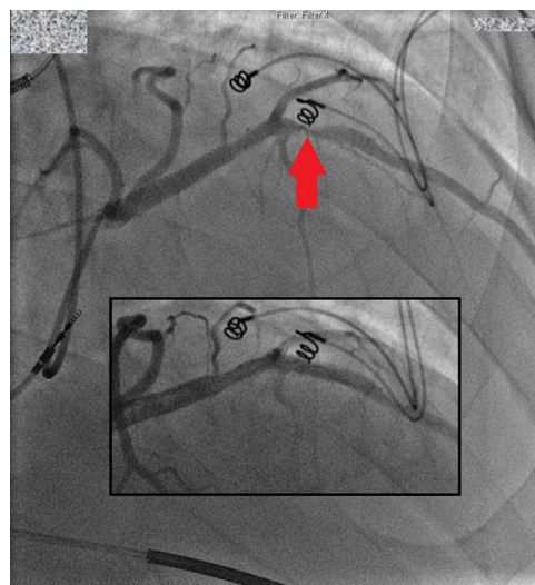
Figure 2 Left heart catheterization demonstrating a severe stenosis to the mid left anterior descending artery (arrow). Inserted is the angiogram displaying the left anterior descending artery following percutaneous coronary intervention.

The patient required inotropic and ventilator support in addition to ultrafiltration (Aquaphoresis) during the hospital course. The patient recovered from cardiogenic shock, pul-