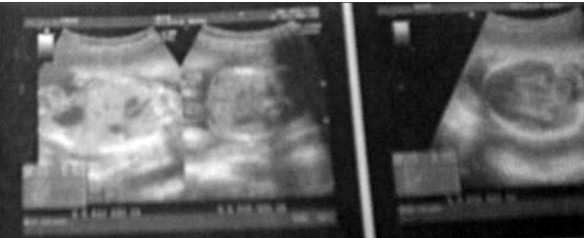
Figure 1: CML in pregnancy – USG abdomen picture in I trimester pregnancy