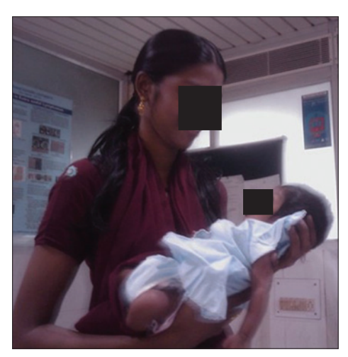
Figure 4: CML in pregnancy – clinical picture of mother and child after pregnancy

tyrosine kinase, the constitutive abnormal gene product of the Philadelphia chromosome in chronic myeloid leukemia (CML). Inhibition of this enzyme blocks proliferation and induces apoptosis in Bcr-Abl-positive cell lines as well as in fresh leukemic cells in Philadelphia chromosome-positive CML. Also it inhibits tyrosine kinase for platelet-derived growth factor (PDGF), stem cell factor (SCF), c-Kit, and cellular events mediated by PDGF and SCF.