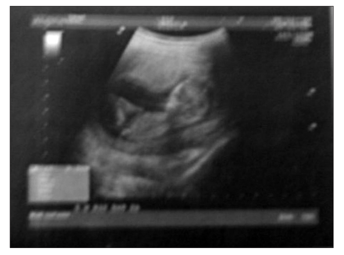
Figure 2: CML in pregnancy – USG abdomen picture in II trimester pregnancy