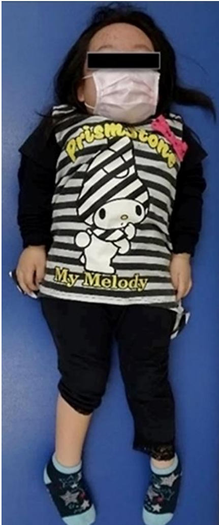
Fig. 1. General appearance of a 13-year-old Japanese girl with spondyloepiphyseal dysplasia congenita. She exhibited short trunk and limbs.