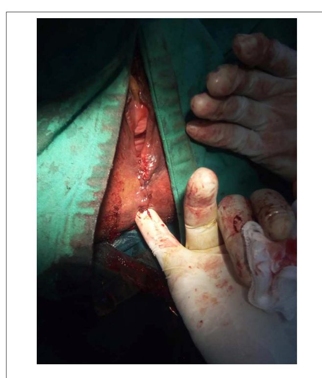
FIGURE 4 | Skin over perineum closed and anal sphincter complex intact with no palpable rectovaginal fistula.