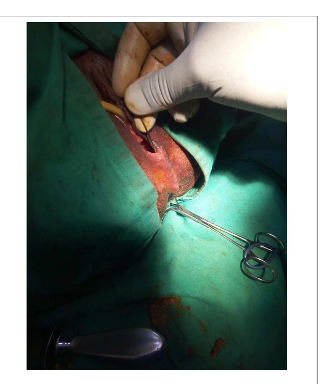
FIGURE 1 | Low rectovaginal fistula delineated with probe.

This was a case of a woman with a persistent simple, low rectovaginal fistula in a low resource setting. Most women with persistent symptomatic disease will not heal without surgical intervention. In addition, rectovaginal fistula from obstetric trauma is usually associated with coexistent occult sphincter injury (2, 6). In the absence of endoanal imaging and physiology there is a rationale in this setting for a fistulotomy which would convert the fistula to a third degree perineal laceration followed by layered closure ( Figures 1–4 ). The perineal approach is not commonly used because of the inherent division of the sphincter