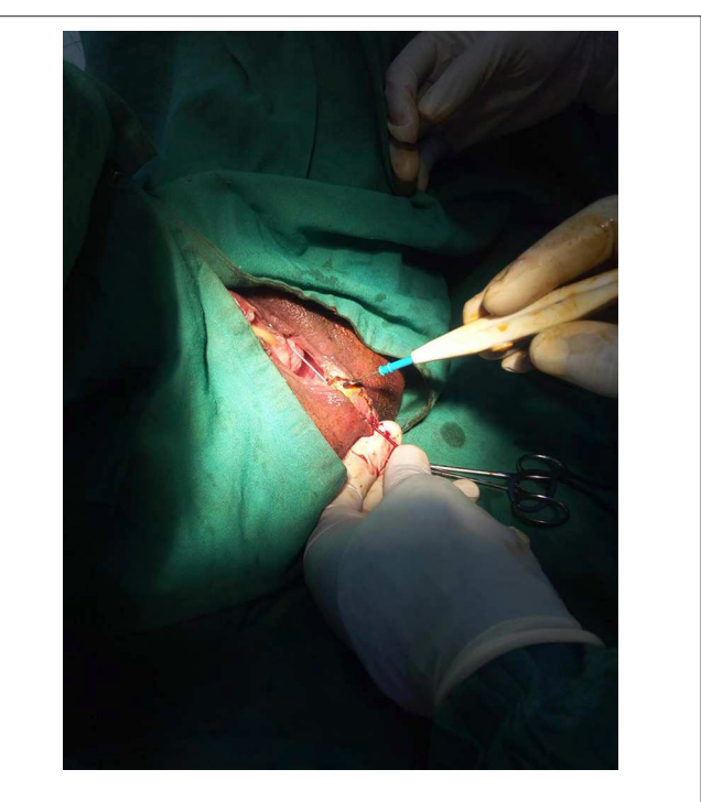
FIGURE 2 | Perineal fistulotomy converting fistula to a third degree tear.

and the unknown rate of subsequent incontinence (7). However, the sphincter muscle is the most vascular tissue between the rectum and vagina, and its use in local repair predisposes to