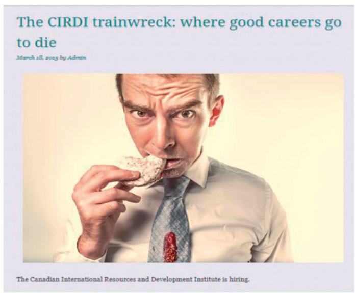
Figure 2. StopTheInstitute visuals.

concerns but took issue with their aggressive tone and asserted the hope that "the goals of the institute [might] be reshaped (or to some, subverted) to further Canadian accountability."77 Additional CCGHR member perspectives voiced at this time criticized CIRDI's lack of responsiveness and adequate communication with potential academic partners (CCGHR members who attended preliminary consultations would also later describe numerous competing visions seeking to shape CIRDI's activities, and a degree of disorganization that impaired the institute's effectiveness). This conversation would be expanded in early 2015 when five CCGHR members informed by StopTheInstitute's efforts—sent a letter of concern to the organization's Board of Directors. The signatories affirmed their confidence that the Spring Institute organizers would develop an "outstanding curriculum" independent of CIRDI's influence but worried that CCGHR might be enrolled in patching up the