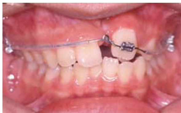
Figure 5 Treatment Progress. 0.017" × 0.025" TMA archwire with loop mesial to the 21, steel ligature to 21 to control the crown position, mesialize the root 21.

Seven months into treatment, there was remarkable increase in the bone at the buccal aspect of tooth 21. A loop was placed on the archwire mesial to tooth 21, and steel ligature was tied to the crown in order to control the crown position while uprighting the root mesially (Figure 5).