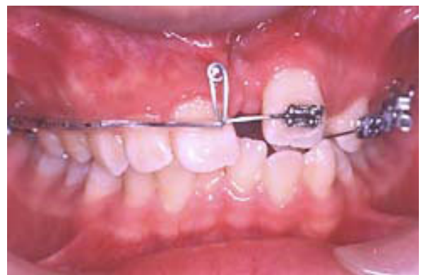
Figure 6 Treatment Progress. Closing loop on 0.017" × 0.025" TMA archwire to mesialize 21. Placement of fixed appliance on the upper left teeth, 0.016" NiTi archwire to align the teeth.