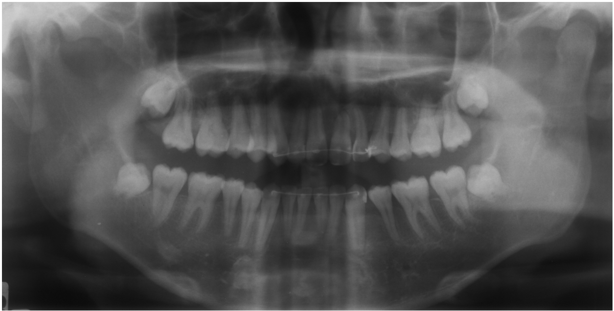
Figure 9 Post treatment panoramic radiograph.

sequence and mechanics took into consideration the advantages of frictionless mechanics (closing loop), and the light force exerted by sectional wire on a long span archwire. These measures were important in addressing the concern of this case report where anterior teeth with short and blunt roots needed to be moved bodily over a considerable distance to close the median diastema region. With proper biomechanics to move the root slowly towards the centreline; this allowed the bone to remodel. The bone defect was narrowed down by bone deposition around the root during the gradual space closure period.