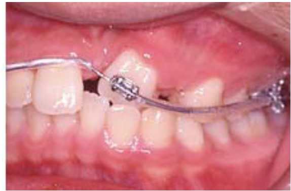
Figure 4 Treatment Progress. 0.017" × 0.025" TMA archwire, palatal root torque at tooth 21.

maxilla. The upper and lower facial heights were increased. There was an increased mandibular plane angle which was in agreement with increased lower facial height, but in good proportion with the upper facial height. The lower incisors were retroclined, and were on the Point A- Po line (Figure 3)