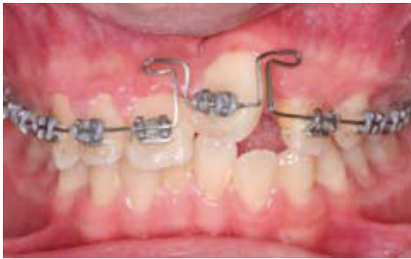
Figure 7 Treatment Progress. Butterfly loop on 0.017" × 0.025" TMA, extrude, palatal root torque application, derotate the tooth 21.

Nine months into treatment, a closing loop was placed to close the median diastema. There were four functions of this mechanics: 1. To close space; 2. To apply palatal root torque continuously; 3. To upright the central incisor; and 4. To provide a slight and long span of force application. This long span of force application would mean a light and continuous force being applied to the tooth. The alignment of upper left segment was also started with 0.016" nickel titanium (NiTi) archwire (Figure 6).