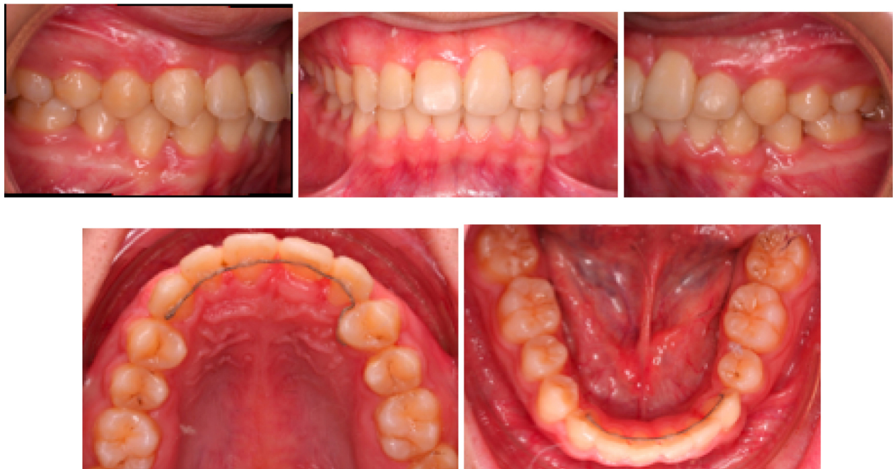
Figure 8 Post treatment extraoral and intraoral photos.

This case report demonstrated an alternative method in the correction of bony defect. The treatment