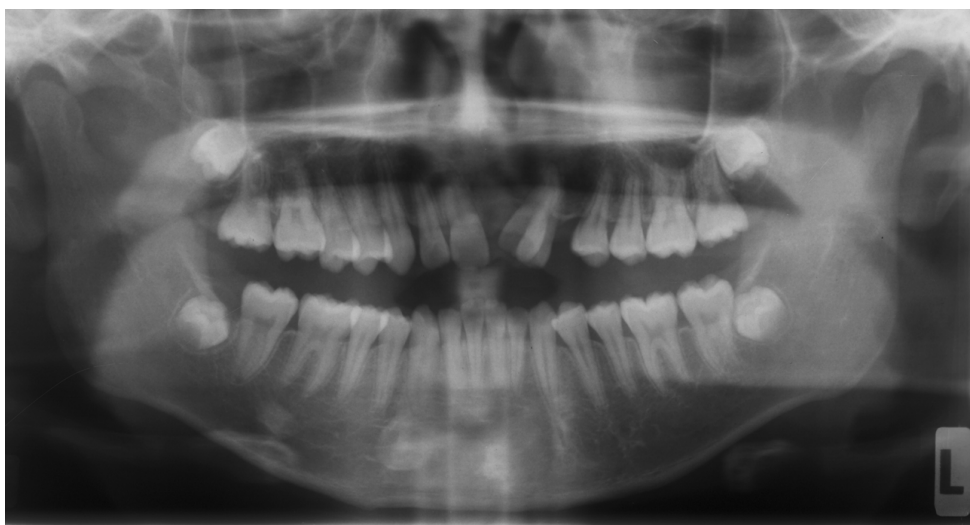
Figure 2 Pre-treatment panoramic radiograph.

The cephalometric analysis showed a skeletal Class I base (ANB and Wit's appraisal) with slightly retrognathic