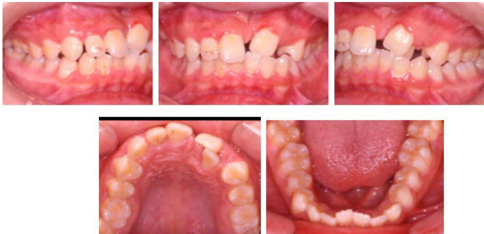
Figure 1 Pre-treatment intraoral views illustrate the dimension of the alveolar bony defect located mesial to apical region of upper left central incisor. The buccal view illustrates the relationship of the upper left central and lateral incisors.

axis. The lips were competent at rest. There was 3.0 mm of incisor show on smiling.