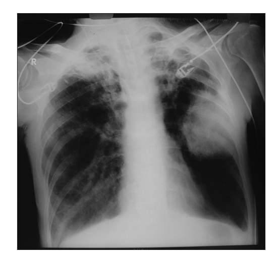
Figure 1: Chest X-ray showing left lung mass