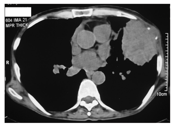
Figure 2: CT thorax showing pleura based mass with rib destruction