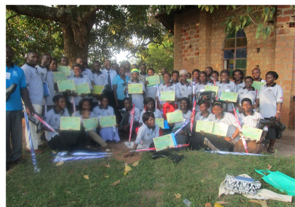
Fig. 4 CHWs displaying their certificates and non-financial incentives they had received after attending a training

Although CHWs were very keen to maintain and ensure that ethical principles were observed in their work, they