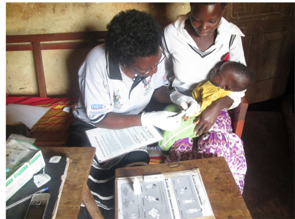
Fig. 2 A female CHW drawing a blood sample from a sick child for malaria diagnosis before treatment while consulting her job aids

“Although we treat children, we are not supposed to handle those above five years of age. If a sick child of six or seven years is brought to us, we can only refer them to a health facility for diagnosis and treatment. It is ethical for us community health workers to follow and stick to guidelines provided to us.” CHW 10, male