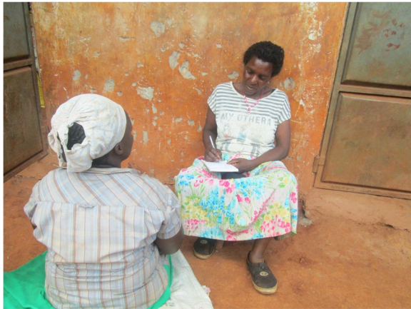
Fig. 3 A CHW during a consultation with a pregnant woman within a setting that ensured privacy