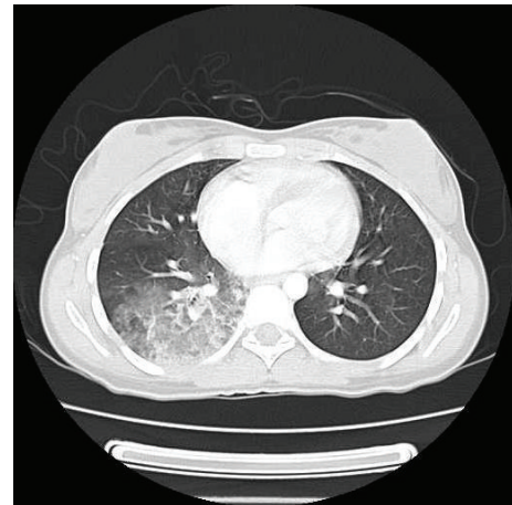
FIGURE 2: Spiral CT scan of the chest demonstrates an area of consolidation and surrounding ground glass opacity in the right lower lobe.

Because FBA was suspected, a flexible bronchoscopy under general anesthesia was performed. We sprayed lidocaine on the patient's vocal cords. A 5 cm worm-like undulating foreign body was found within the right lower lobe anteromedial bronchus (B 7,8 ) (Figure 3). Also, there were some blood clots in the right mainstem bronchus (B 7 ). We sprayed lidocaine on the worm to help detaching it. While trying to remove the worm by forceps, it ruptured and the leech's sucker remained attached to the mucosa. Next, the involved bronchus was washed with hypertonic saline (3%) solution to help removing the attached segment. A Dormia basket was passed through the remaining worm particle; it was then closed. After that, Dormia basket and the bronchoscope tube were removed. Figure 4 shows B 8 bronchus after complete removal of the leech. The animal's particle and the bronchoscopic tissue forceps biopsy were sent to the pathology lab, which confirmed that the foreign body was a leech. Figure 5 shows the leech's body after removal.