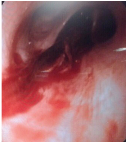
FIGURE 3: Image capture of the ruptured leech completely obstructing the right lower lobe bronchus ( B_8 ).