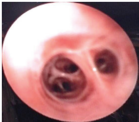
FIGURE 4: Right lower lobe bronchus ( B_8 ) following immediate removal of the leech.

sooner if the history includes drinking from infested waters, but in our case she reported to us that she drank from ab anbar (a traditional source of drinking water), after hirudiniasis was confirmed. Since our patient's clinical manifestation (hematemesis, vomiting, and melena) was similar to gastrointestinal bleeding, her diagnosis was delayed.