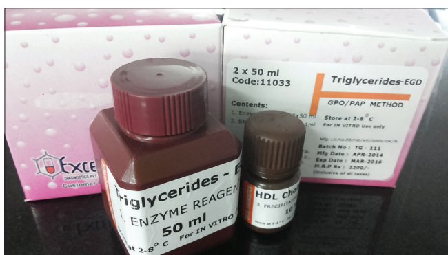
Figure 2: Commercially available lipid profile reagents have been used to mix with the serum sample.