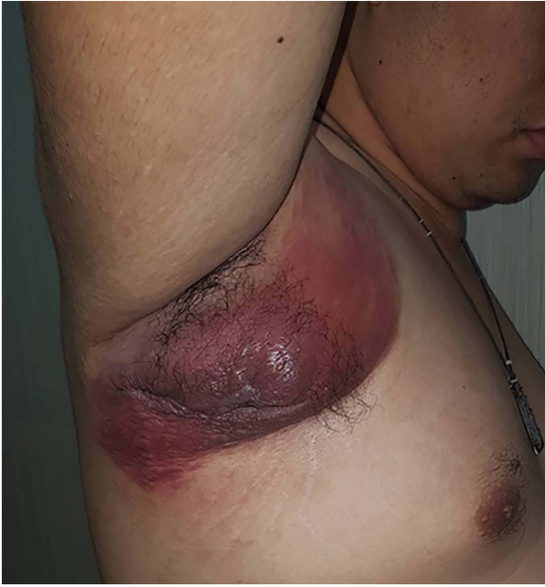
Figure 1: Right axillary mass.