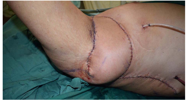
Figure 2: Parascapular fasciocutaneous flap.

On pathologic gross inspection of the mass, it consisted of skin covered with fibrofatty tissue and was measured to be 19.5 × 10 × 4.5 cm. On sectioning, there was a well-circumscribed pale, tan and rubbery mass, 10 × 6.5 × 6 cm, with areas of hemorrhage and was located 0.3 cm from the nearest basal margins. The microscopic examination of the mass showed sections of malignant neoplasm composed of sheets of highly pleomorphic cells with abundant pale, vacuolated and fluffy appearing cytoplasm with distinct borders and small to large vesicular nuclei with prominent nucleoli, while some nuclei appeared pyknotic (Fig. 3). The surrounding stroma was fibrous, with heavy mononuclear infiltration. The neoplasm showed infiltrative borders. Sections of the skin were free of tumor. No