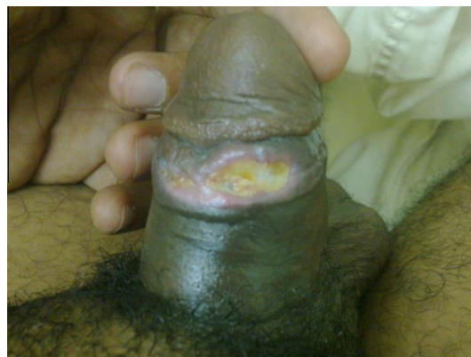
Figure 2 Superficial wound dehiscence at the level of the subcoronal incision; this patient was managed conservatively with broad-spectrum antibiotics.

In the first 2 weeks after surgery there was no significant morbidity in all patients, apart from a mild inflammatory reaction manifested as penile skin oedema and bruising. Five patients in each group continued with no complications. At 3 weeks after surgery there were dramatic local changes in five patients in group 1, who developed severe penile oedema with ischaemic dorsal