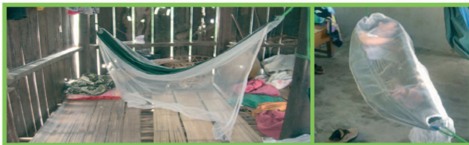
Figure 1. LLIH used for the trial. doi:10.1371/journal.pone.0029991.g001

Data collection. Qualitative data collection techniques consisted of participant observation, interviews, and group discussions. During participant observation, the researchers participated in everyday activities, observing events in their usual context and carrying out reiterated informal conversations and