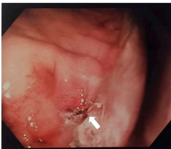
Figure 2. Gastric wall defect 6 hours after inadvertent removal of PEG tube (white arrow). Note partial sealing of the defect.