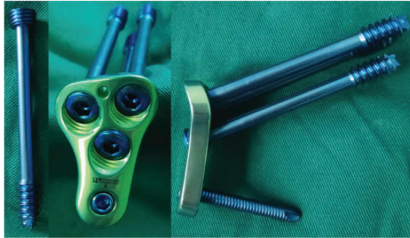
Figure 1. Triangular locking plate internal fixation system.

our experience, we hypothesized that surgical internal fixation can be performed as a minimally invasive operation with little damage and few complications. It may be more effective than the traditional technique involving three hollow locking screws. In the present retrospective study, we analyzed patients with refractory Pauwels type III femoral neck fractures who were treated with minimally invasive open reduction and a proximal femoral triangular locked plate system from March 2012 to August 2016. This article summarizes the key technical aspects of this internal fixation method.