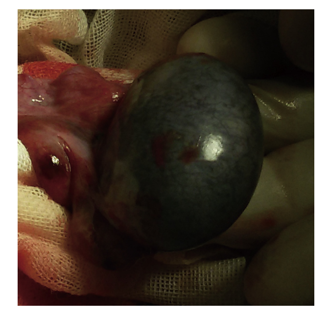
Figure 1 This testis necrotized because the ischemia time was too long (more than 6 h).