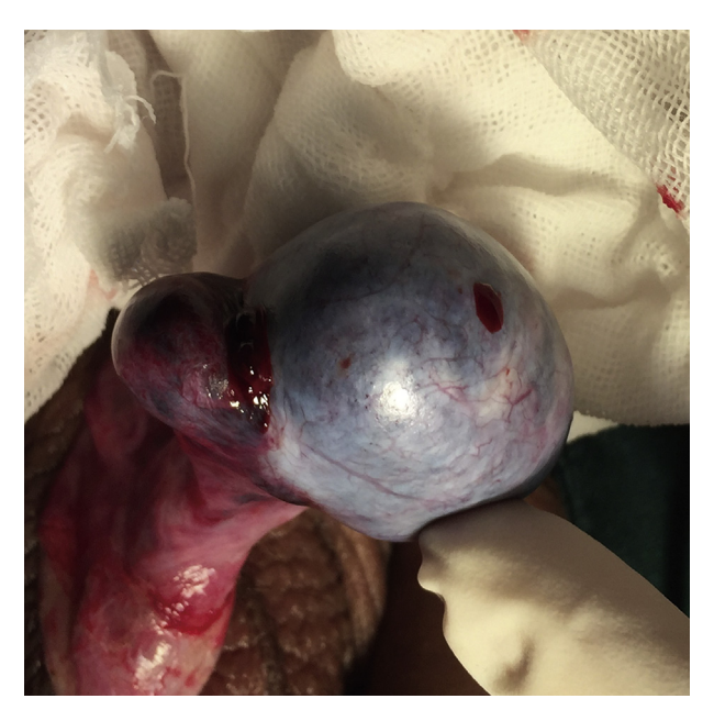
Figure 2 This testis remained vital after detorsion.