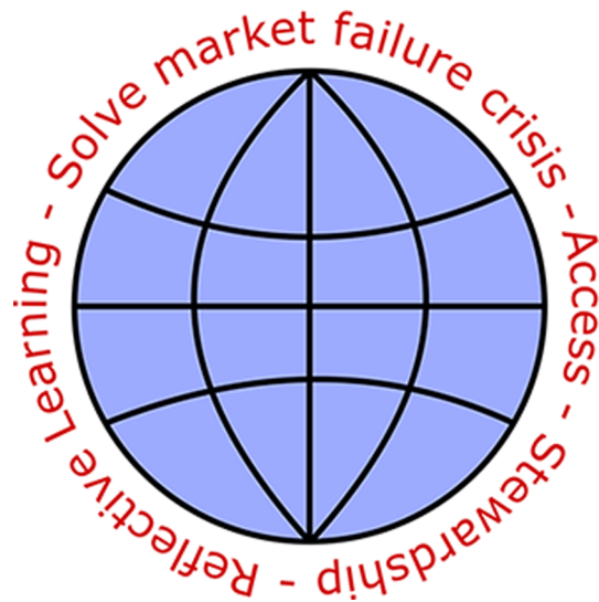
Figure 3. Global coordination is needed to solve the market failure crisis in antimicrobials and to balance access versus stewardship requirements across the globe. Continuous dialogue and reflective learning across nations will be critical for combatting the myriad policy challenges of AMR at a global level.

In relation to point a above, given the magnitude of costs needed to incentivize antimicrobial development, it is imperative that governments in HICs bring together finance and health ministries to help lever the resources required. The proposed treaty may provide an umbrella under which these efforts could be pooled. One potential mechanism that might