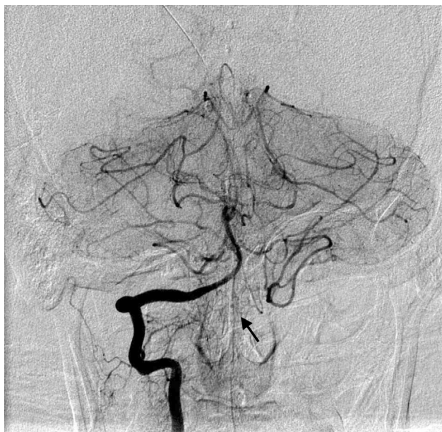
Fig. 2 Angiography demonstrates a 1.3-mm diameter aneurysm arising from the anterior spinal artery at the C1 level (black arrow). There is mild-moderate vasospasm of the posterior circulation related to the patient's prior subarachnoid hemorrhage. There is no other supply to the anterior spinal artery from the more proximal right vertebral artery or from the left vertebral artery.

and observed in the intensive care unit (ICU). Seven days after her initial presentation she reported a severe headache. CT with angiogram showed new IVH in the fourth ventricle as well as posterior circulation vasospasm. A follow-up DSA revealed a small ( 1 \times 1 \times 1.3 mm) aneurysm arising from the proximal ASA as well as angiographic vasospasm ( Fig. 2 ). Due to her symptoms and rerupture of the aneurysm,