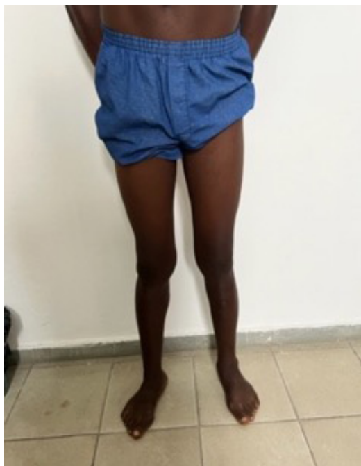
Fig. 4. Standing limb appearance at 20-month posttreatment. Note the right valgus knee.

crine pathologies. Our patient had no notable medical history, suggesting that the bilateral detachment was likely due to the injury mechanism of direct back-to-front impact in a standing individual with late physeal fusion. Closed reduction using external movements and pinning is the treatment method most commonly recommended to minimize the risk of complications [7–10]. However, this closed-focus approach should be performed promptly to ensure its effectiveness. The relatively long delay in managing the patient necessitated an open reduction and pin-