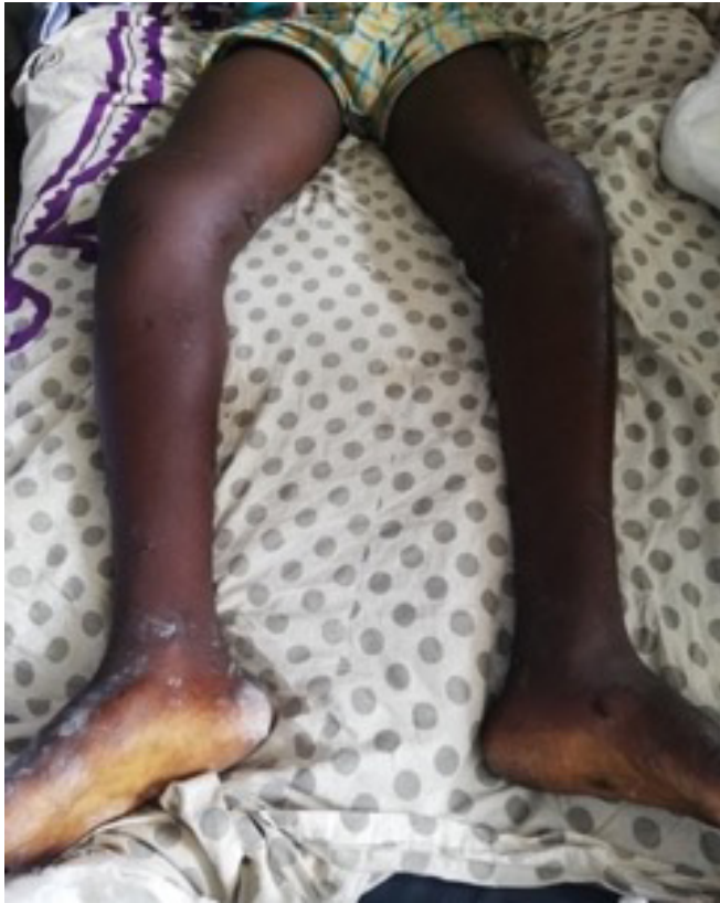
Fig. 1. Frontal view of the pelvic limbs. Note the swelling associated with abduction and external rotation.

No attempt had been made at reduction prior to the patient's admission to our unit. Routine laboratory tests and blood calci-